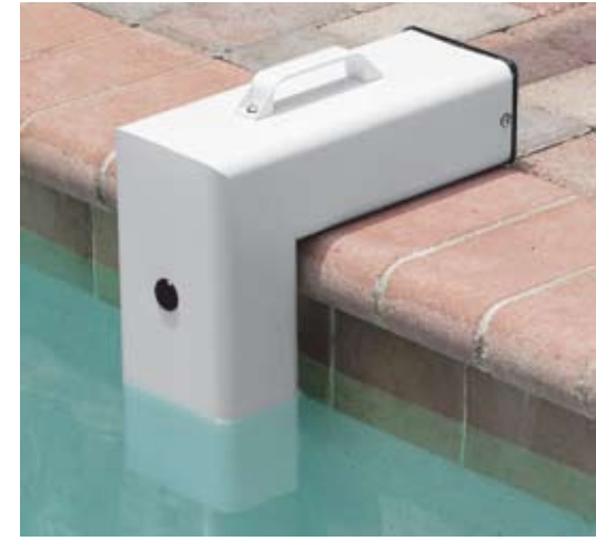
Pool Protector sits on pool deck

If someone who does not know how to put the Pool Protector in sleep mode attempts to remove the alarm, it will sound an alarm. The Pool Protector